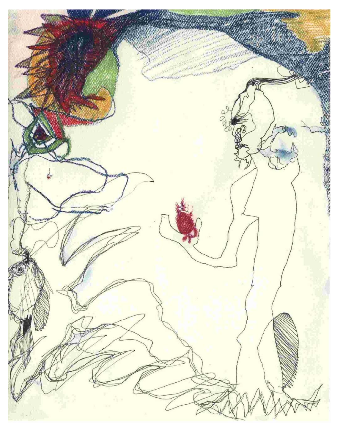
Squish by Alan Fishman