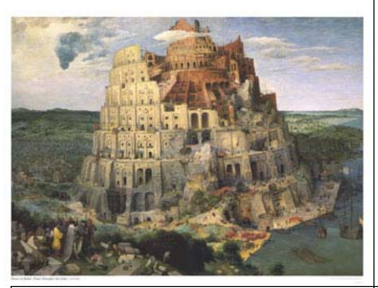
The Tower of Babel by Pieter Bruegel the Elder from the Kunsthistorisches Museum in Vienna, Austria